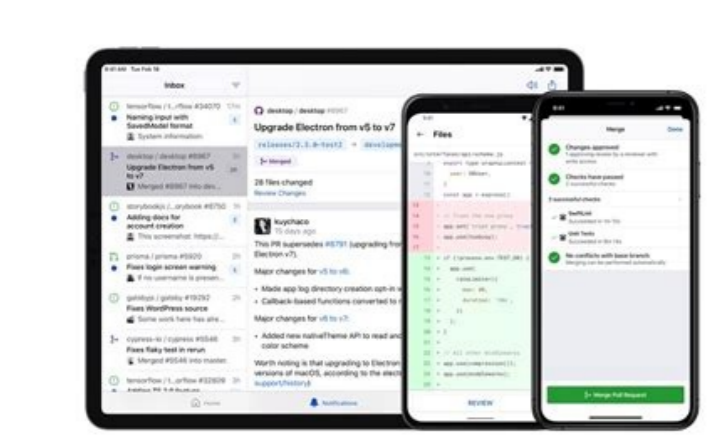
Best browser app for android. Android browser app source code github.